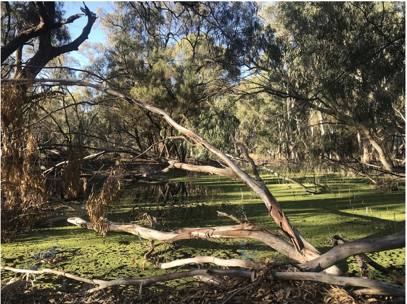
Figure 1: Pilby Lagoon inlet on the Chowilla Floodplain