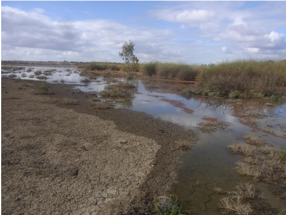
Figure 2: Water for the environment spreading across the Pike Floodplain during the current operation